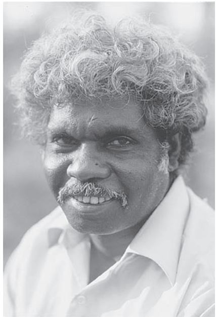
A Native Australian.