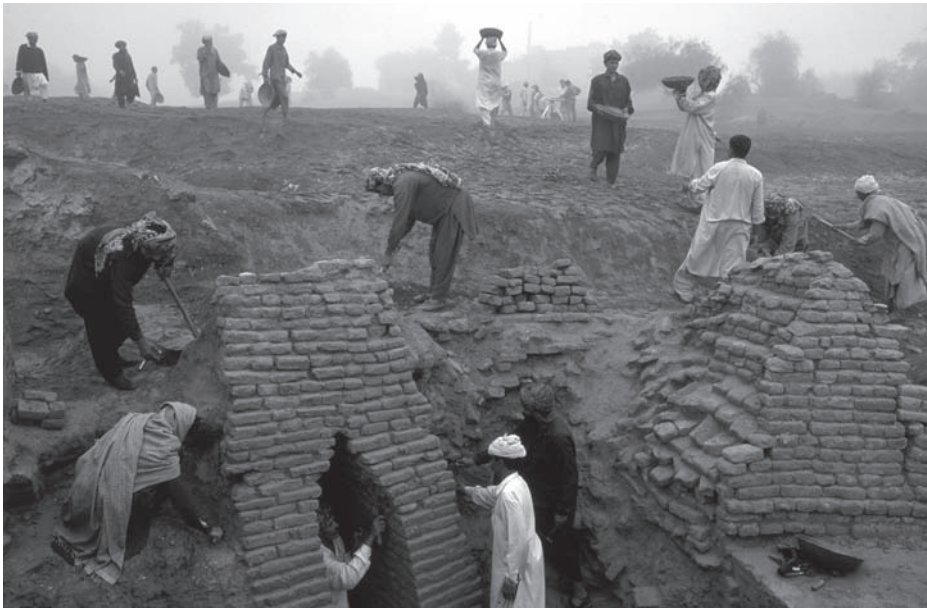
An archaeological team works at Harappa, one site from an ancient Indus River civilization dating back some 4,800 years.

Archaeologists have spent much time studying potsherds, fragments of earthenware. Potsherds are more durable than many other artifacts, such as textiles and wood. The quantity of pottery fragments allows estimates of population size and density. The discovery that potters used materials that were not available locally suggests systems