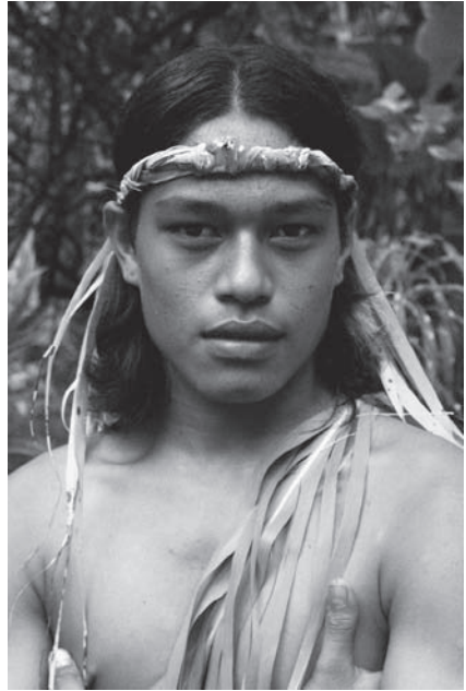
A young man from the Marquesas Islands in Polynesia.