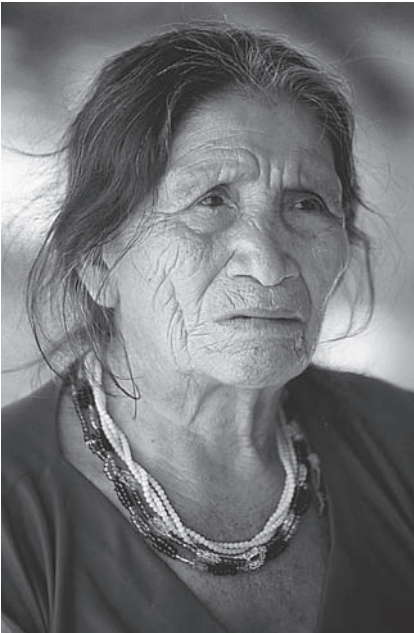
A Native American: a Chiquitanos Indian woman from Bolivia.