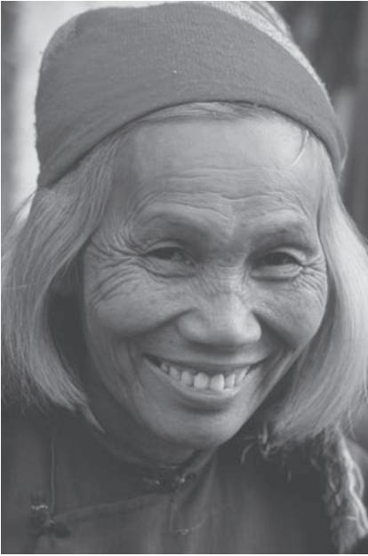
The photos in this chapter illustrate only a small part of the range of human biological diversity. Shown above is a woman from Guangzhou province, People's Republic of China.