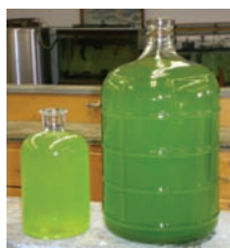
Algae is grown to extract oil for biodiesel.