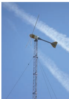
Wind energy is harnessed to collect electricity.