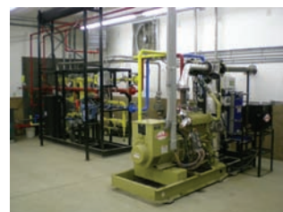
Cow manure fuels our anaerobic digester, producing biogas for electricity and heat.